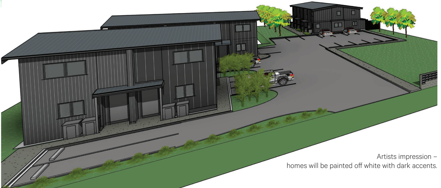
Artists impression – homes will be painted off white with dark accents.

To address the urgent need for public housing in Gisborne, Kāinga Ora has agreed to purchase eleven homes that developers RND Projects are building at 785 Childers Road, Elgin Gisborne.